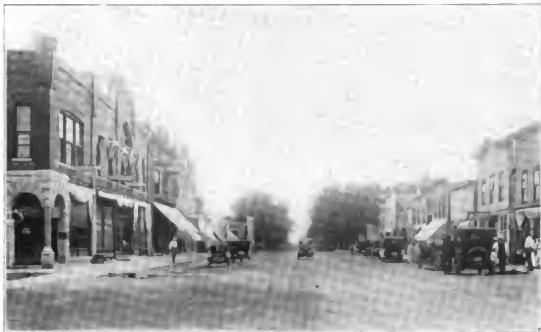
SCENE ON MAIN STREET, SOUTH, BRITT